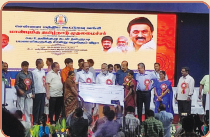
Hindu Religious and Charitable Endowments through Chennai Central Cooperative Bank, New Washermanpet.

Through savings and internal loans economically they are sound. Training in maintenance of accounts, book keeping have also helped them. After six months they were rated and then given Credit linkage so that they can do economic activities. Sakthi Self-Help Group received Rs.15,00,000/- from Hon'ble Minister Mr. Sekhar Babu,